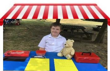
Monty's 'Guess Teddy's fFavourite Sweets' Game